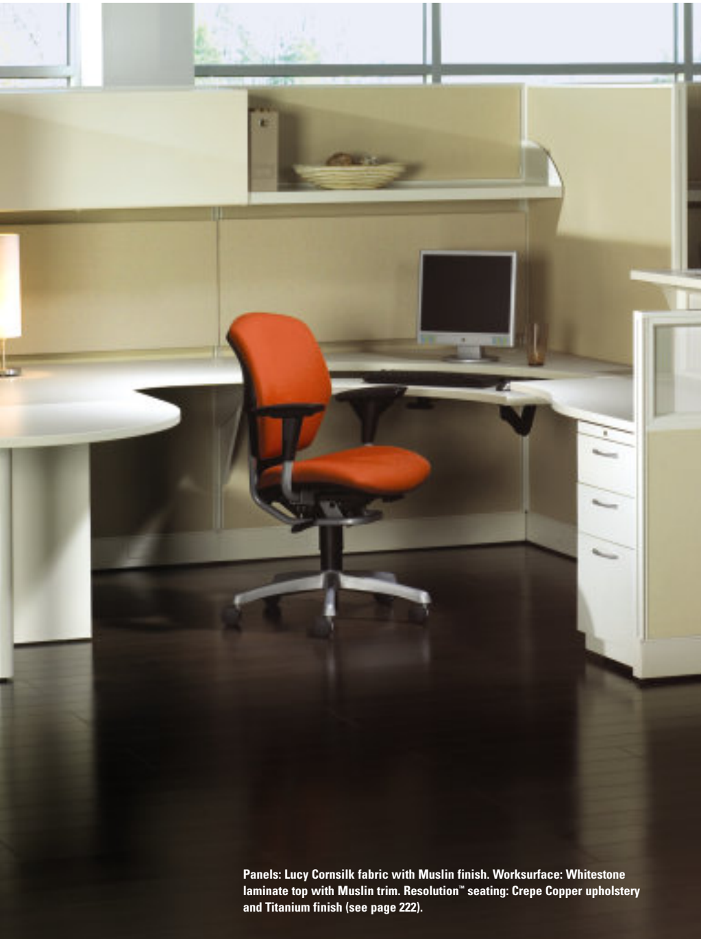
Panels: Lucy Cornsilk fabric with Muslin finish. Worksurface: Whitestone laminate top with Muslin trim. Resolution™ seating: Crepe Copper upholstery and Titanium finish (see page 222).