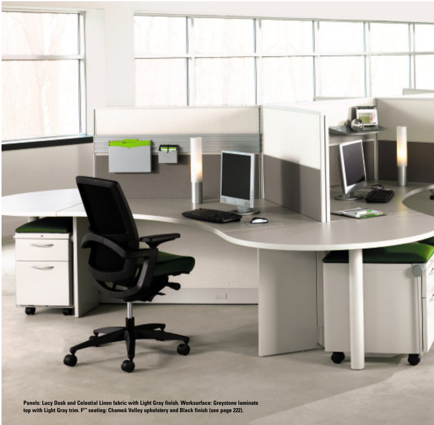
Panels: Lucy Dusk and Celestial Linen fabric with Light Gray finish. Worksurface: Greystone laminate top with Light Gray trim. F™ seating: Chameã Valley upholstery and Black finish (see page 222).

Sustainable. Initiate tackable panels utilize Nature Core™, a revolutionary fiberboard exclusive to Initiate. A plant-based, acoustical and tackable substrate, Nature Core is made from the annually renewable, sustainable material Kenaf. Nature Core is a low-emitting material and therefore helps to lower air emissions from furniture in the workplace. If “greening” your office is a priority, Initiate panels with Nature Core are a must-have.