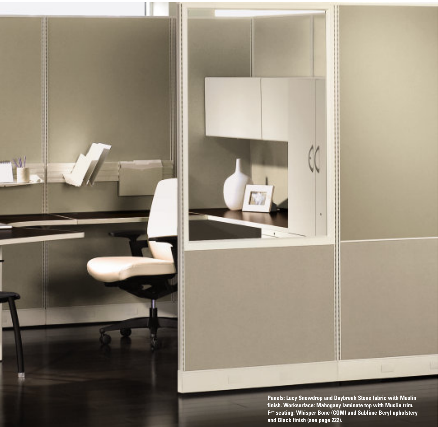
Panels: Lucy Snowdrop and Daybreak Stone fabric with Muslin finish. Worksurface: Mahogany laminate top with Muslin trim. F 3 ™ seating: Whisper Bone (COM) and Sublime Beryl upholstery and Black finish (see page 222).