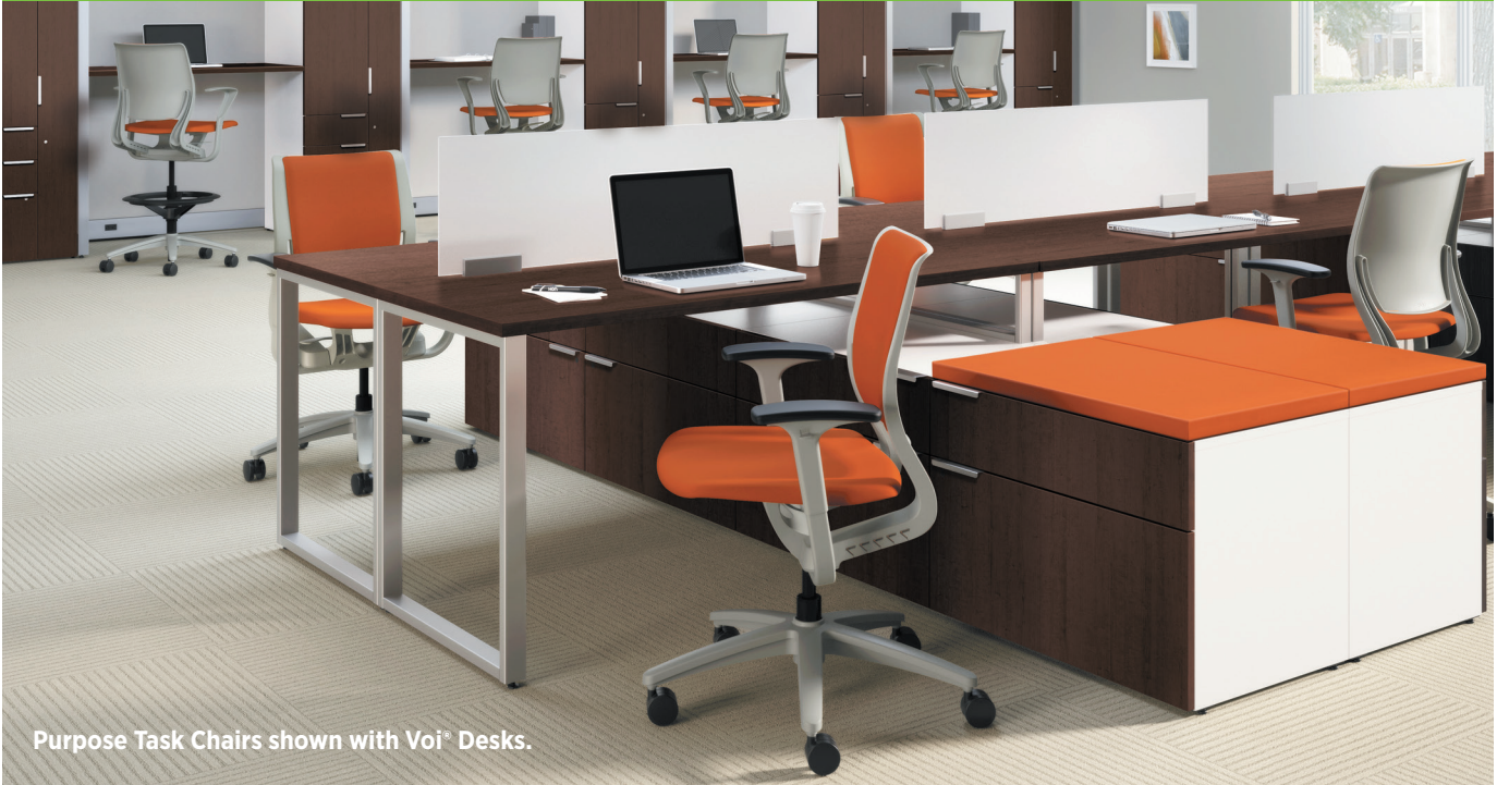
Purpose Task Chairs shown with Voi® Desks.