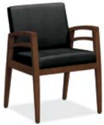
STAND ALONE GUEST CHAIR 23"W x 24½"D x 33¼"H

Plan your seating arrangement around your needs and existing architecture with a combination of straight rows of seating, stand-alone chairs, and corner and center tables.