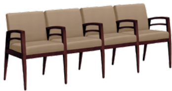
FOUR-SEAT GANGED UNIT 87½"W x 24¼"D x 33¼"H